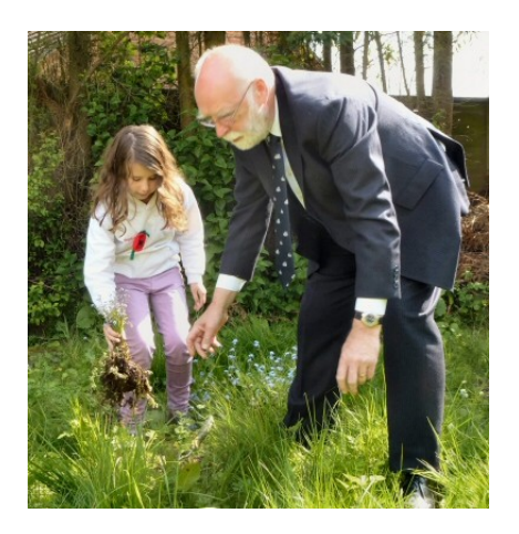
From one generation to another.

On 4th May during the service we gathered in the new piece of land in the church yard allocated as cremation plots. To commemorate the 100 years of the First World War we scattered red and white poppy seeds and forget-me-not seeds. We look forward to seeing them flower.